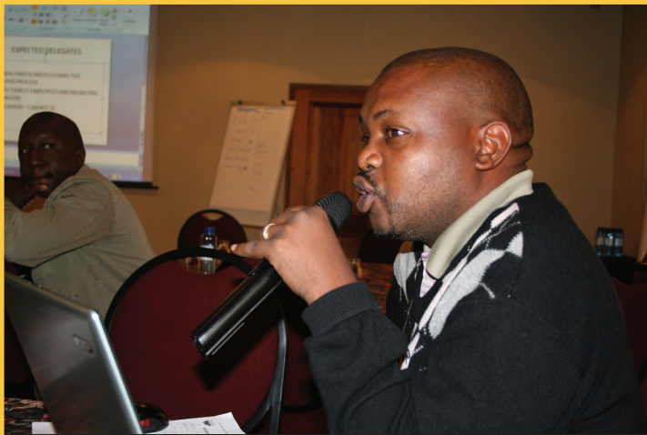
INTERACTION: An official from Lekwa Municipality makes a point during an IDP Analysis Workshop in Brumfelcia