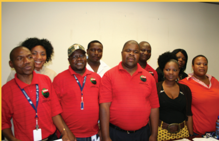
AT THE HELM: Newly elected branch leaders of NEHAWU in the Department of Co-operative Governance and Traditional Affairs