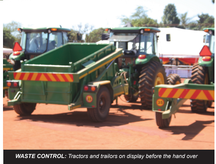
WASTE CONTROL: Tractors and trailers on display before the hand over

The department is also assisting municipalities in the establishment of land fill sites. Recently, the department assisted the Msukaligwa Municipality to establish a land fill site in Ermelo.