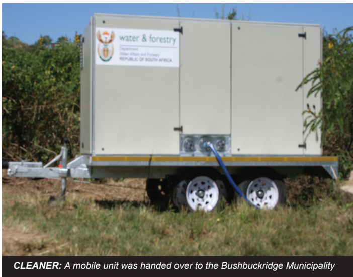
CLEANER: A mobile unit was handed over to the Bushbuckridge Municipality