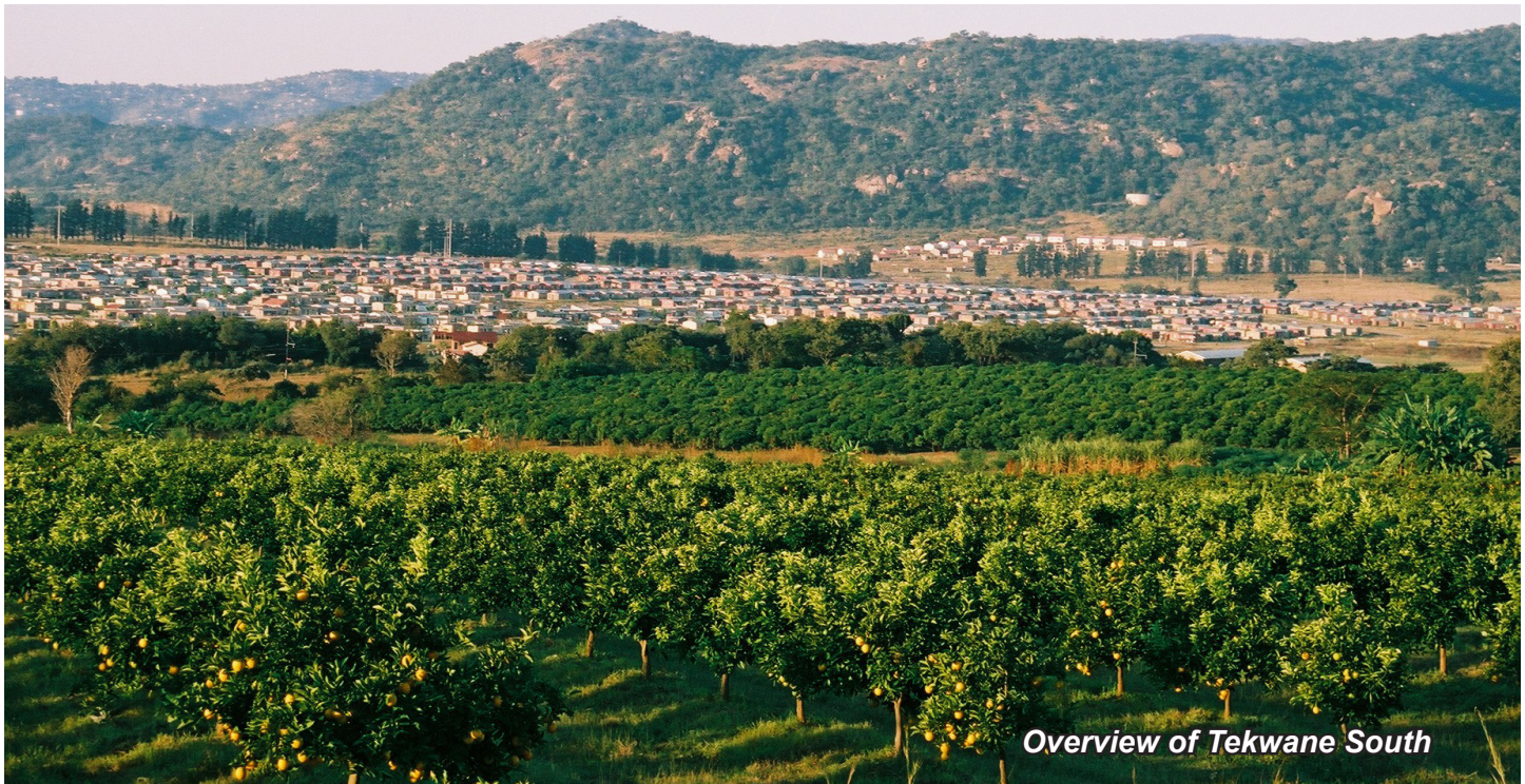
Overview of Tekwane South