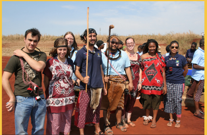
BREAKING NEW GROUND: American volunteers in traditional gear.